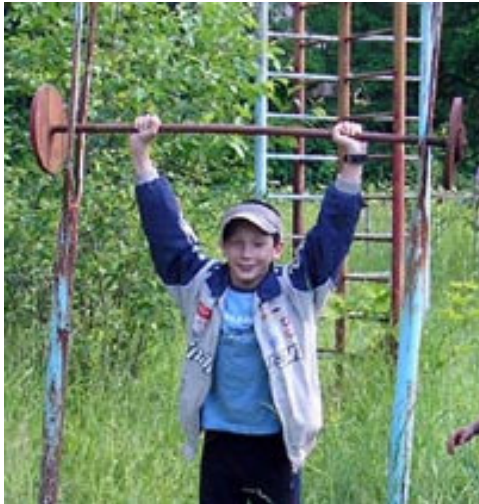
Building up those muscles...

“Worship that is pure and unblemished in the sight of God the father is this: to visit and help and care for the widows and orphans in their affliction and need....” James 1:27 (AMP)