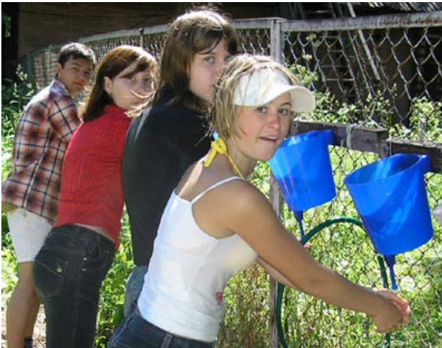
Make sure you wash those hands...!